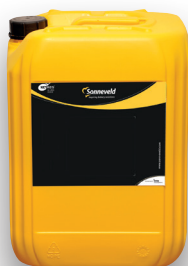
10 L jerry can 20 L jerry can