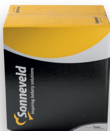
10 L bag-in-box