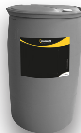
210 L drum