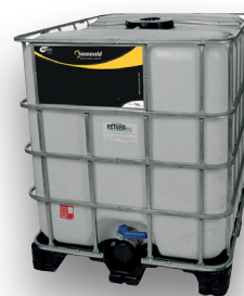
1000 L container

Rietgorsweg 1-3 3356 LJ Papendrecht The Netherlands T +31 78 644 25 25 export@sonneveld.com www.sonneveld.com