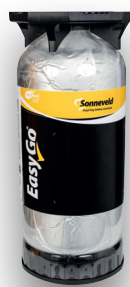
20 L Easy Go®